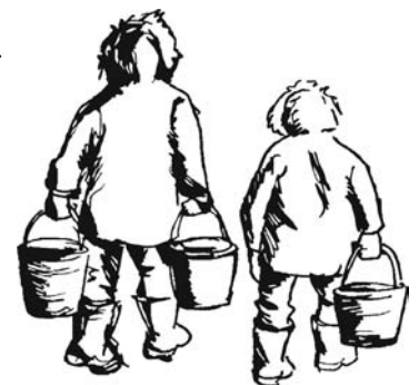
Alaskan Native Knowledge Network