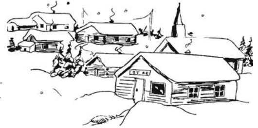
Alaskan Native Knowledge Network

As I write on the eve of Winter Solstice, our shortest day of the year, those of us in the far north are celebrating the turning point of diminishing daylight to the sun-filled days soon to come. I always feel good on Winter Solstice. It brings about hope and optimism. 2010 will present DCC with challenges on many fronts, as have previous years. My optimism to meet those challenges in the coming year is high, as usual. Of course I do love a challenge.